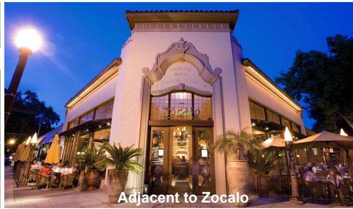
Adjacent to Zocalo