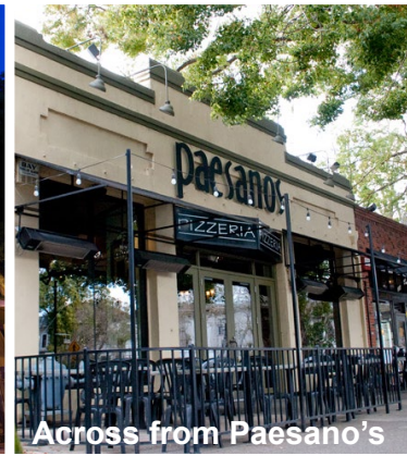
Across from Paesano's