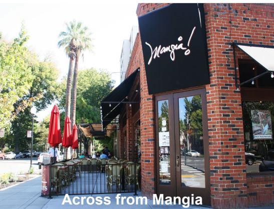
Across from Mangia