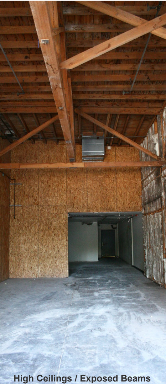
High Ceilings / Exposed Beams