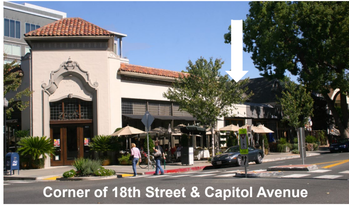
Corner of 18th Street & Capitol Avenue