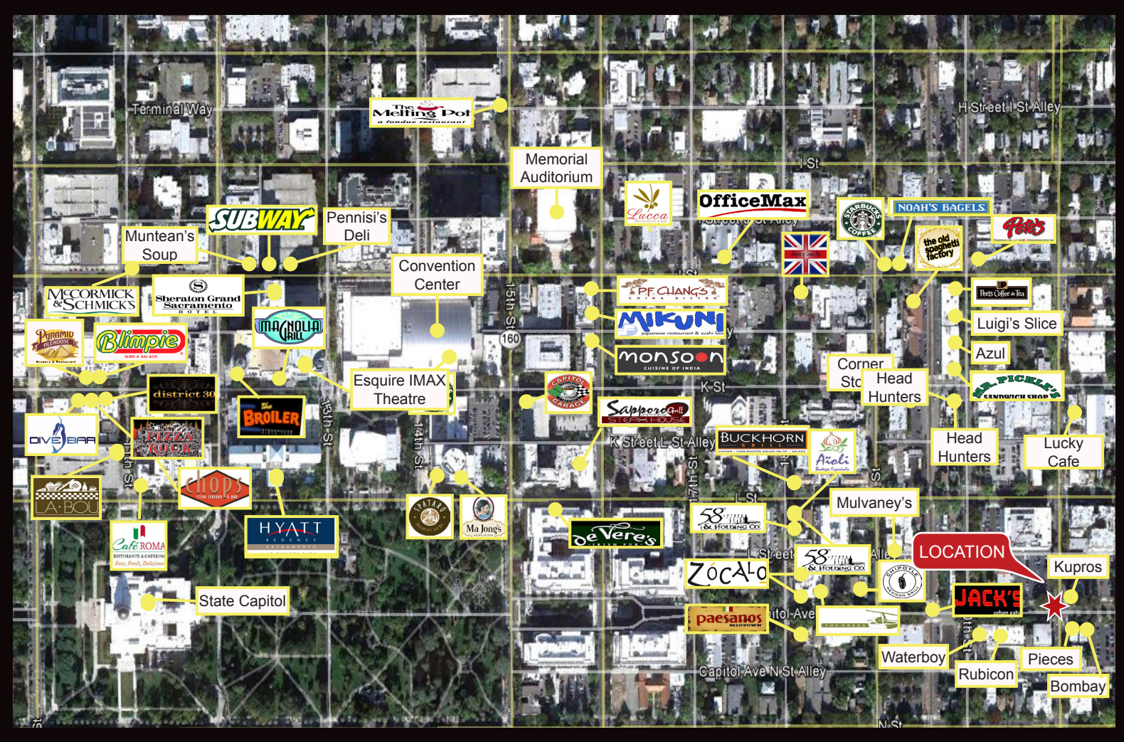
© 2013 This information has been secured from sources believed to be reliable. Any projections, opinions, assumptions or estimates used are for example only and do not constitute any warranty or representation as to the accuracy of the information. All information should be verified through an independent investigation by the recipient, prior to execution of legal documents or purchase, to determine the suitability of the property for their needs. Logos and/or pictures are displayed for visual purposes only and are the property of their respective owners.