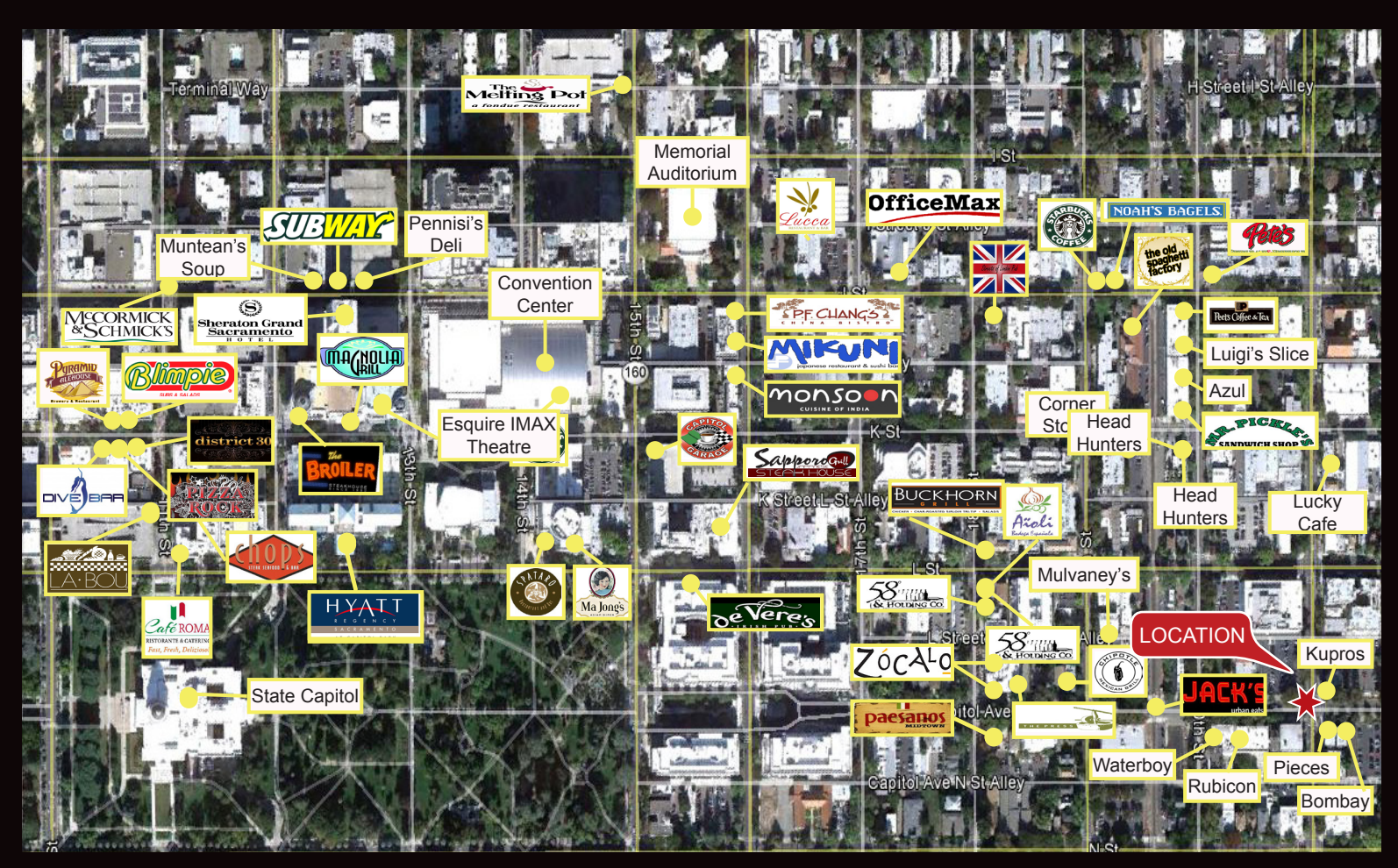
© 2013 This information has been secured from sources believed to be reliable. Any projections, opinions, assumptions or estimates used are for example only and do not constitute any warranty or representation as to the accuracy of the information. All information should be verified through an independent investigation by the recipient, prior to execution of legal documents or purchase, to determine the suitability of the property for their needs. Logos and/or pictures are displayed for visual purposes only and are the property of their respective owners.