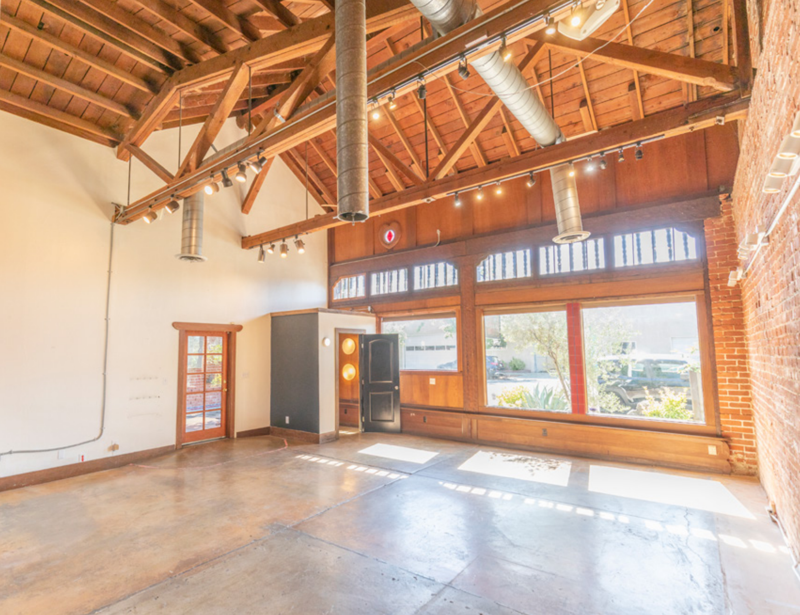
image of the spaces will give future occupants the perfect canvas to create an incredible workplace culture to recruit and retain the best talent for years to come. The open and flexible floor plan will provide an atmosphere that shapes great client experiences and a strong company brand.

ald Walburg. The interior architectural features are all exposed: wood beam vaulted ceilings, red brick walls, hard ducting, and polished cement floors. The project is across the street from Canon restaurant and Fitness Rangers, and within close proximity to some of East Sacramento's best restaurants and amenities. The layout and